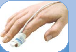
7000A Adult Flexi-Form II (> 30 kg / > 66 lb)

*Optional Reusable Sensor Extension Cables are available in 1m, 3m, 6m and 9m lengths.