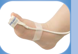
7000I Infant Flexi-Form II (2 - 20 kg / 4 - 44 lbs)