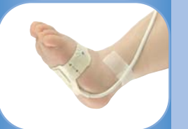
7000N Neonatal Flexi-Form II (< 2 kg / < 4 lbs)