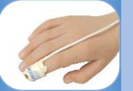
7000P Pediatric Flexi-Form II (10 - 40 kg / 22 - 88 lbs)