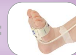
Neonate Flex System (< 2 kg / < 4 lbs)